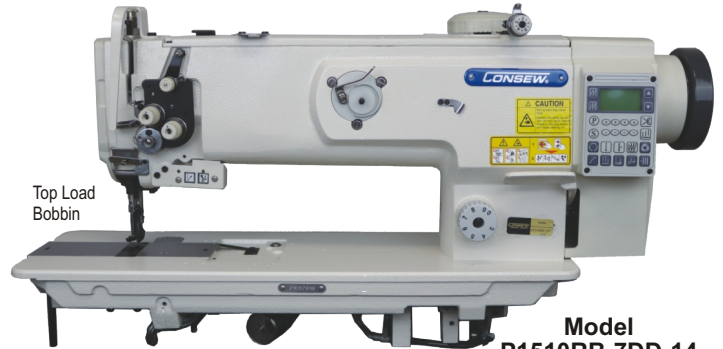
Model P1510RB-7DD-14 1-Needle

Direct Drive internal Motor Speed, maximum: 2500 - 3000 spm Stitch Length; Max. 9mm Presser Foot Lift By Hand: 9 mm By Knee: 16mm Lubrication: Semi-Automatic Adjustable Presser Feet Climbing Built in Bobbin Winder Safety Clutch