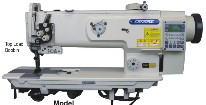
Model P1560RB-7DD-14 2-Needle

Currently Available in 220VAC Version ONLY.