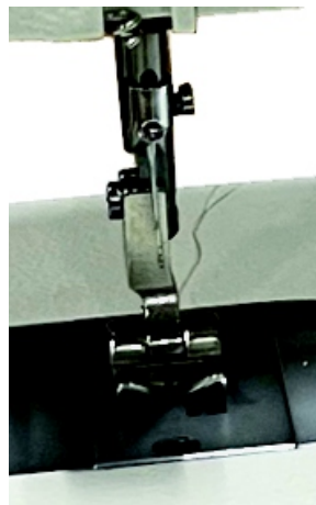
Closeup of needle