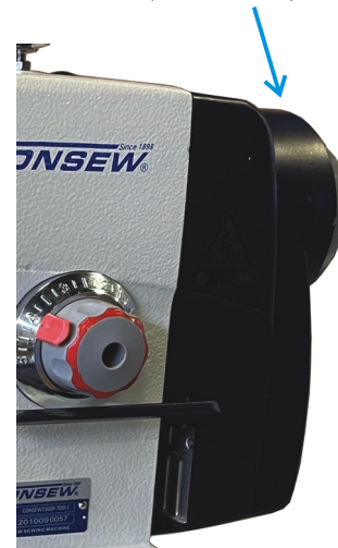
Built-In, Direct Drive 3/4HP, 550 watt Motor (110v or 220v)