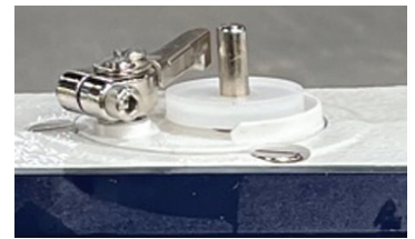
Built-in Bobbin Winder