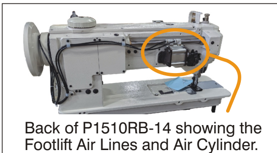
Back of P1510RB-14 showing the Footlift Air Lines and Air Cylinder.

To be used with Consew motors CSM3002 and CSM4002