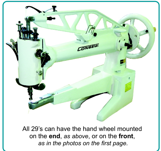
All 29's can have the hand wheel mounted on the end , as above, or on the front , as in the photos on the first page.