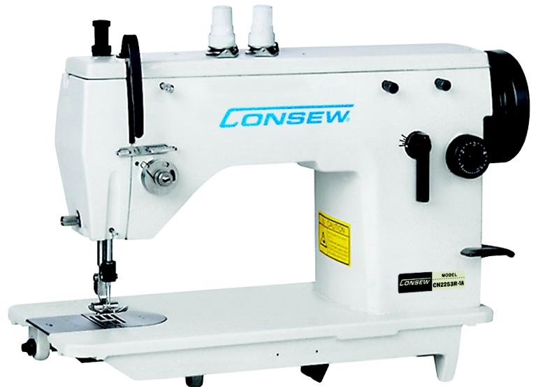
CN2253R-2A with Double Needle