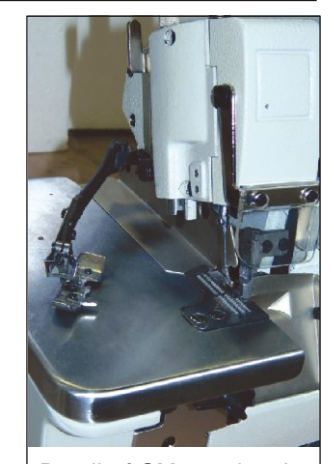
Detail of CM795 showing convenient swing-out presser foot assembly

Max. Sewing Speed: 6,500 S.P.M. Presser Foot Lift: 5.5 mm Differential Ratio: 1:0.7 ~1.7 Needle Gauge (2): 2 mm standard Overedging Width: 4 mm Stitch Length, Max: 3.8 mm Number of Threads: 4/5 Needle: DC x 27 size 14