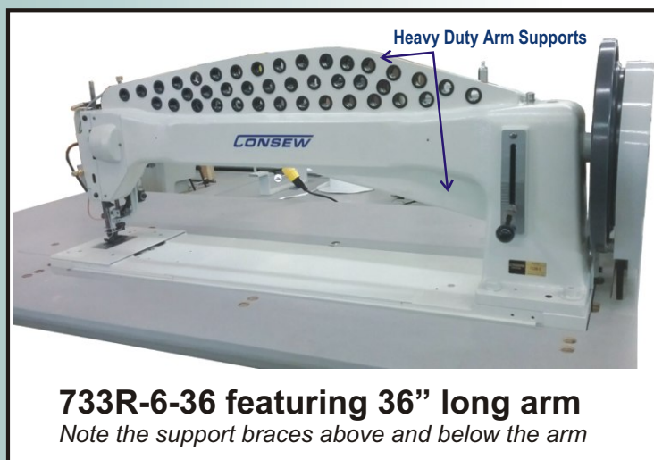
733R-6-36 featuring 36" long arm Note the support braces above and below the arm

EXTRA HEAVY DUTY LONG ARM SINGLE NEEDLE DROP FEED ALTERNATING PRESSER FEET LOCKSTITCH MACHINE