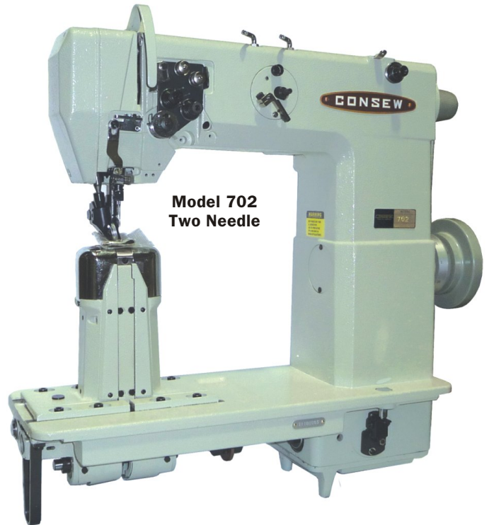
Model 702 Two Needle