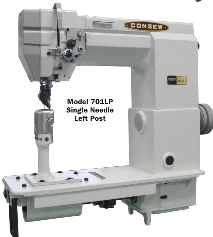
Model 701LP Single Needle Left Post

HIGH SPEED SINGLE AND TWO-NEEDLE POST BED LOCKSTITCH MACHINES