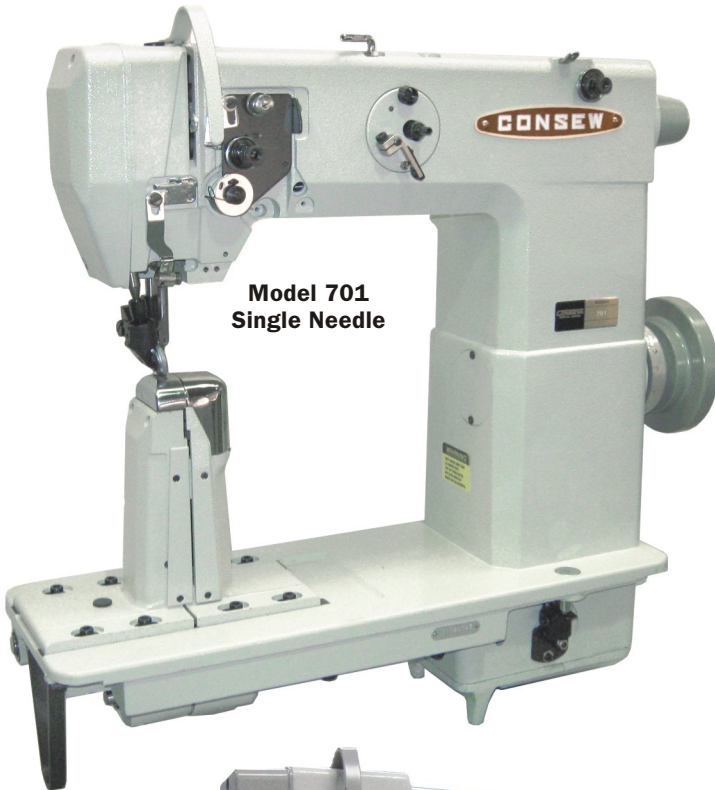
Model 701 Single Needle