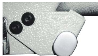
Push Button Reverse. Automatic Backtack Button conveniently located to the right of the needle