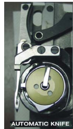
Auto Thread Cutter Mechanism

Call for information about 255RBL25ATCL(N) Long Arm