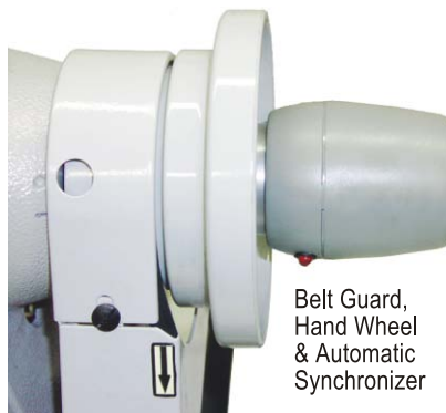
Belt Guard, Hand Wheel & Automatic Synchronizer